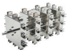
Rotisserie-type, horizontal Code LJJ001 For 48 tubes of 1,5 mL