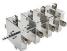
Rotisserie-type, vertical Code LJJ005 For 16 tubes of 15 mL