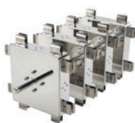
Rotisserie-type, vertical Code LJJ004 For 32 tubes of 1,5 mL