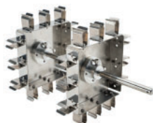
Rotisserie-type, horizontal Code LJJ002 For 24 tubes of 15 mL