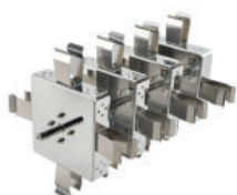
Rotisserie-type, vertical Code LJJ006* For 16 tubes of 50 mL *included with the equipment