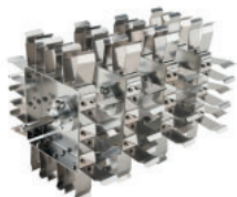
Rotisserie-type, horizontal Code LJJ003 For 24 tubes of 50 mL