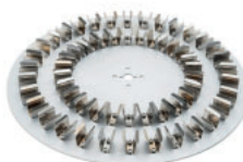
Disk-type Code LJJ007 For 60 tubes of 1,5 mL