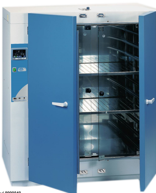
Models Part No. 2000239 and 2000240.

Note: To obtain the optimum homogeneity at the set temperature, the load should not surpass more than 70 % of the volume of the chamber.