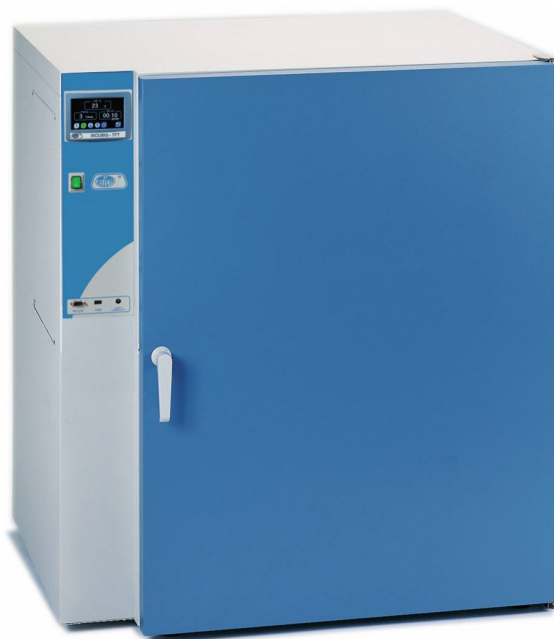
Model Part No. 2000238.

For Part No. 2000239 and 2000240, 2 shelves.