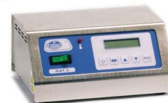
System programmer for temperature/time RAT-2. Part No. 4001538